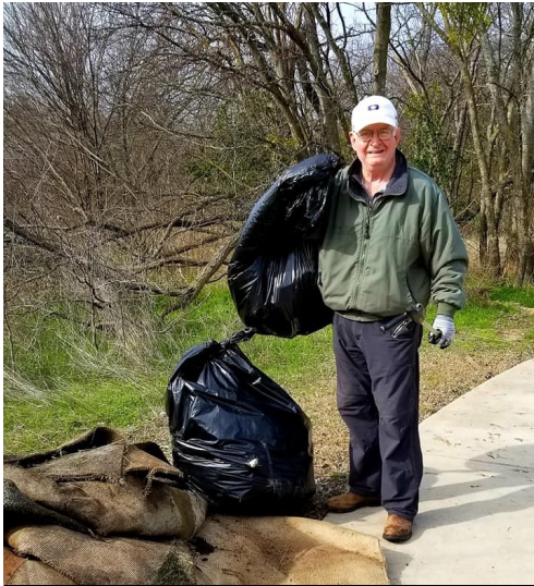
Look who's cleaning up Cravens Park!