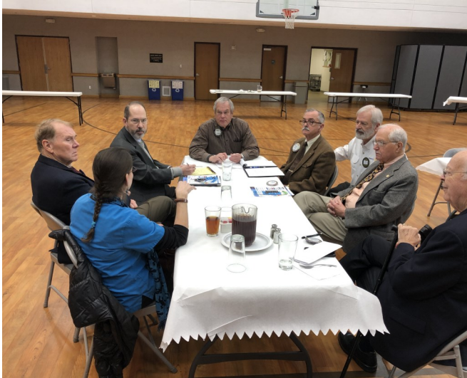
Members working on developing a strategy to obtain funding for the Honduras Clean Water project.