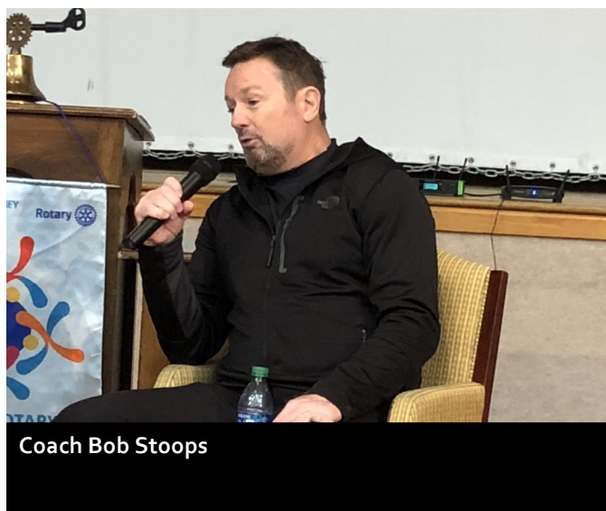
Coach Bob Stoops