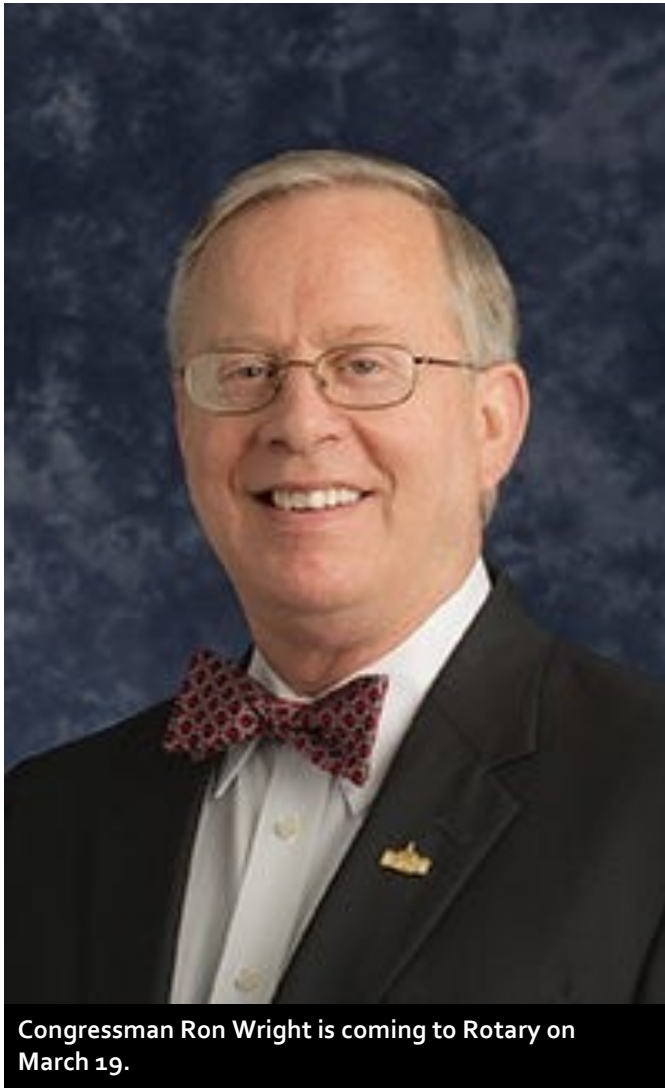
Congressman Ron Wright is coming to Rotary on March 19.