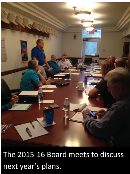
The 2015-16 Board meets to discuss next year's plans.

Some projects we are still working on are the Books for the Webb Students, and the annual Rotary Golf Tournament . The golf tournament is less than a week away. If you have not registered yet, we can still fit you into the fun. This is our major fund raiser for our Foundation. There are numerous ways to support the golf tournament, such as holes to sponsor, and golfer positions still available. It will