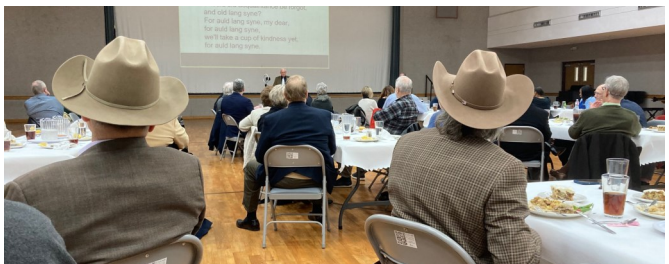
Great attendance again last week, even if it is Stock Show time.