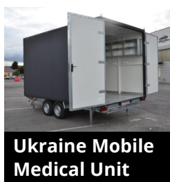
Ukraine Mobile Medical Unit

The grant will be used to provide Mobile Emergency Clinics for use in Ukraine to treat rape and minor trauma victims, victims with trauma to the face involving teeth, and overnight stays for patients awaiting transit to a nearby hospital. The trailers will be manufactured in Ukraine and the three units together will operate as a multi-functional hospital, specially designed for war casualties. The trailers are designed to resist damage from