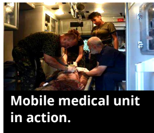
Mobile medical unit in action.

This grant is an excellent example of The Rotary Foundation and our club making a difference internationally.