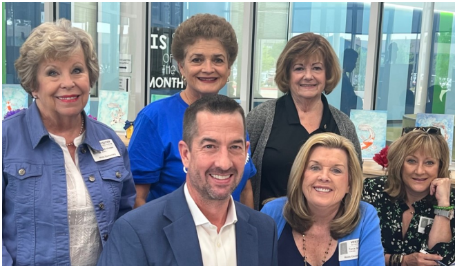
Some of the club volunteers helping with Read with Rotary 2023.