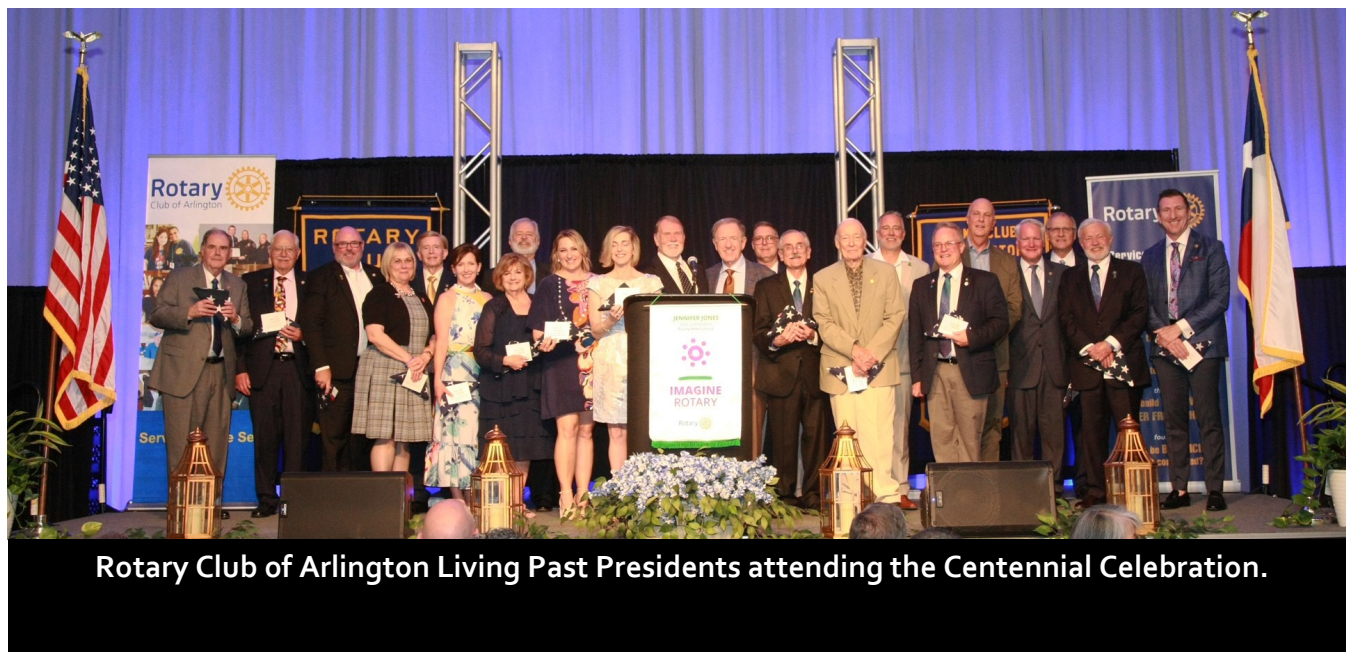
Rotary Club of Arlington Living Past Presidents attending the Centennial Celebration.