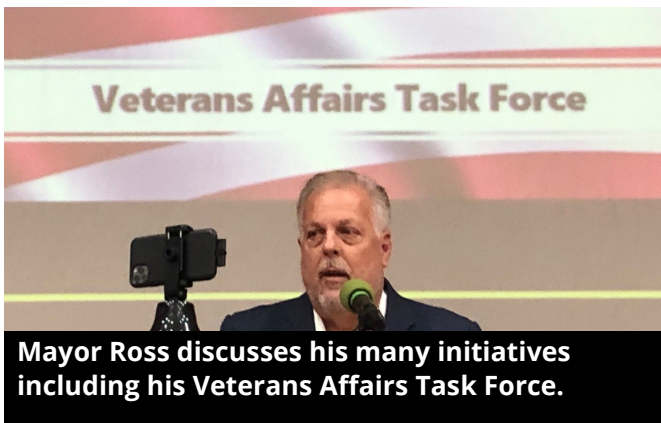
Mayor Ross discusses his many initiatives including his Veterans Affairs Task Force.