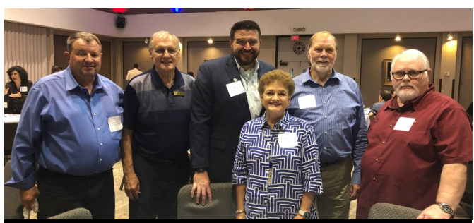
Some of the Rotary Club of Arlington members recognized at the City of Arlington Boards and Commissions reception.