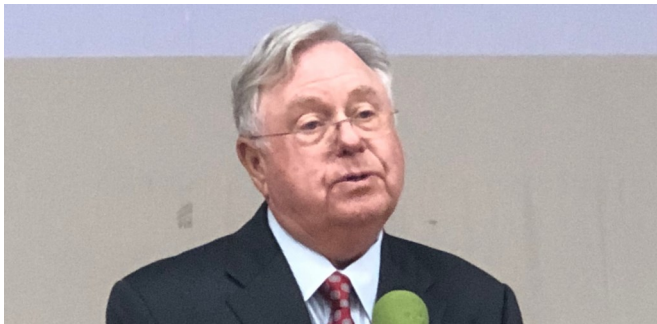
Kris leaves us with a last laugh to ponder.