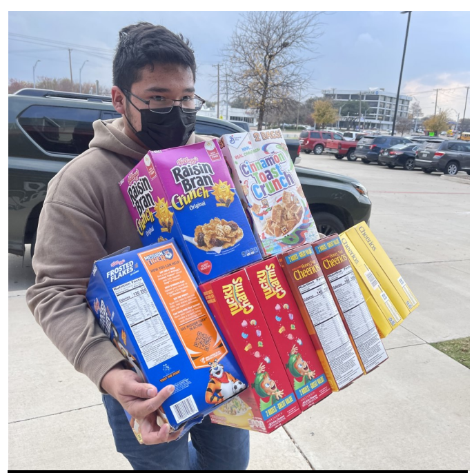
Our Interact Club's first project is to collect and distribute breakfast cereal to those in need.