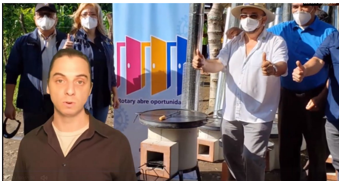
Stove Team International was started by a Rotarian and Rotary is a major supporter.