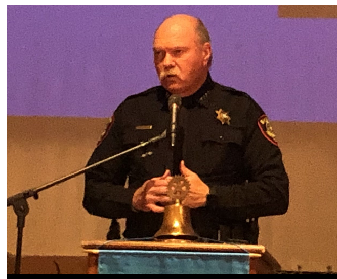
Sheriff Bill Waybourn talks about the evil problem of human trafficking.

In closing Sheriff Waybourn shared that narcotics is still a major focus with a rise in fentanyl and the decrease in price of methamphetamines. The Tarrant County jail is the largest treatment facility for mental health in Tarrant County. Sheriff Waybourn plans to push for 100 new detention officers and plans to announce this soon. (6)