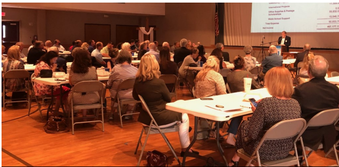
Great turnout! Good to see everyone.