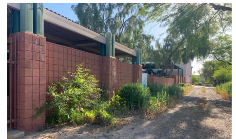
Photo shows some of the weeds behind the YMCA building.

Once the weeds are sprayed and die, we will need hands-on help to collect them for removal.