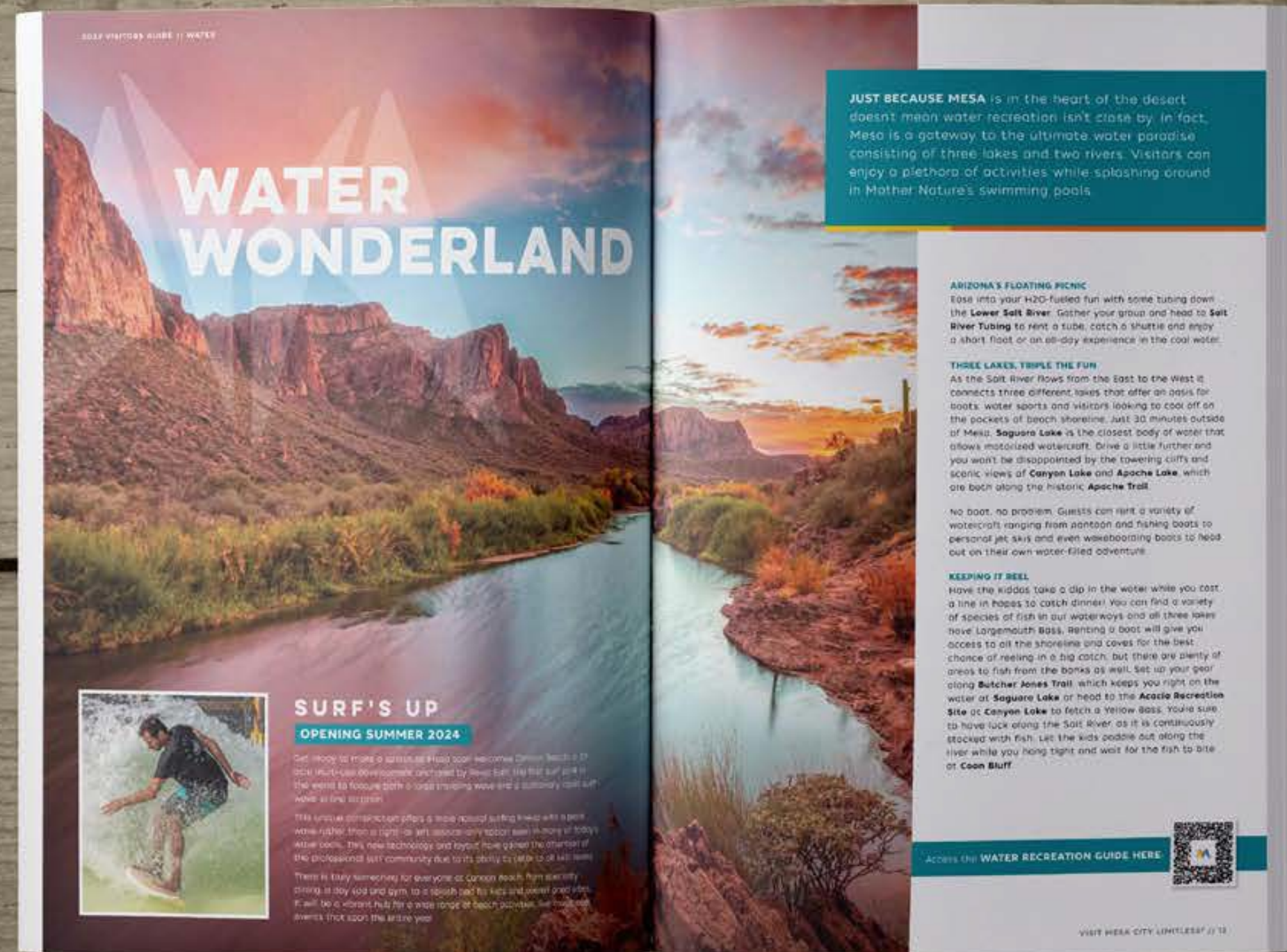
Includes editorials and listings of everything that is city limitless.