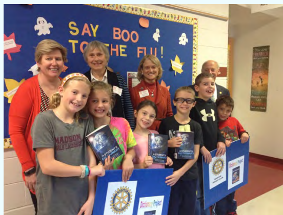
Members of the Madison Rotary Club hand out dictionaries to third grade students in their community Read more...

The following is an account of the Madison Club's experience with this project: