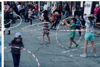
And to hula hoop!