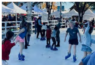
'Tis the Season to Ice Skate!