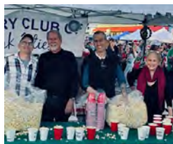
RCPC members served Popcorn + Water!