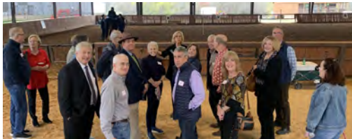
As a part of the tour members got to watch a rider in the arena.