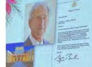
Letter from Pres. Bush