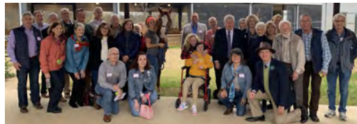
Prior to starting a tour of the facility, a group photo was made. The tour included the stables, the arena, and the tack room, including meeting quite a few of the horses.

Our Mission Building a legacy of good works and fellowship, we strive to: REACH those in need in partnership with others INSPIRE tomorrow's leaders with high ethical standards FOSTER lives of service above self - A supporting member of Rotary International