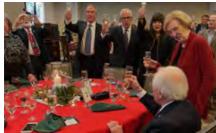
A Toast to C. C.!