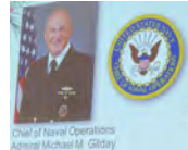
Letter from the Navy