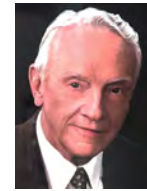
2003 Hon. Ed Wooten