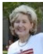
2005 Hon. Kay B. Hutchinson