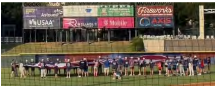
Rotarians waving the flag during the National Anthem.