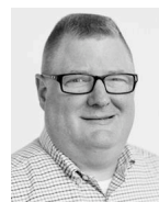
William Taylor Newspapers