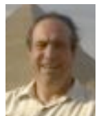
Mike Petridis Aircraft Sales