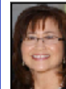
Pat Martin Newspapers