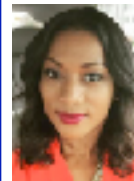
Kita Hobbs Utilities