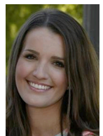
Kelly Roby Hotels