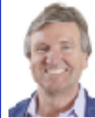
Chris Blackman Real Estate