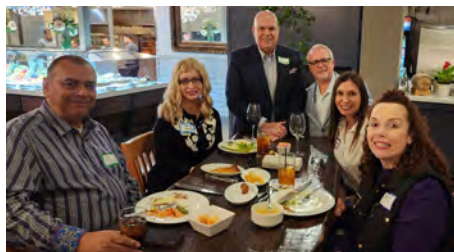
The RCPC Contingent