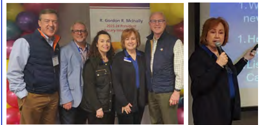
The RCPC Contingent