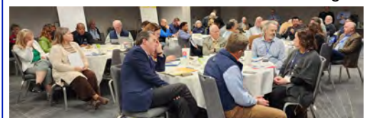
The District 5810 Group

Be a Vibrant and Visionary Model of Service Above and Beyond Self