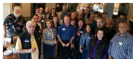
The District 5810 Group