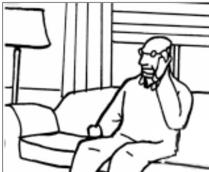
"Just sitting here widening."