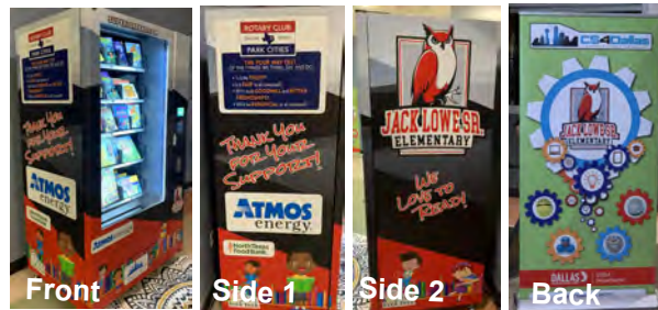
The Book Vending Machine! Wow!