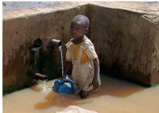
First place winner