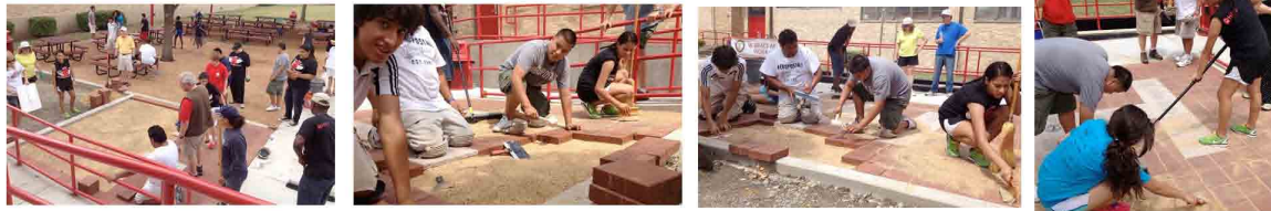
It was teamwork from start to finish!