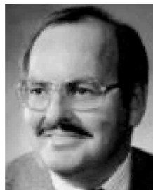
Cub Amos Classification: Construction Date Joined: Oct, 1975