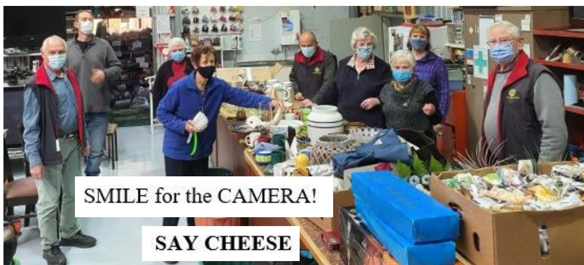
SMILE for the CAMERA!