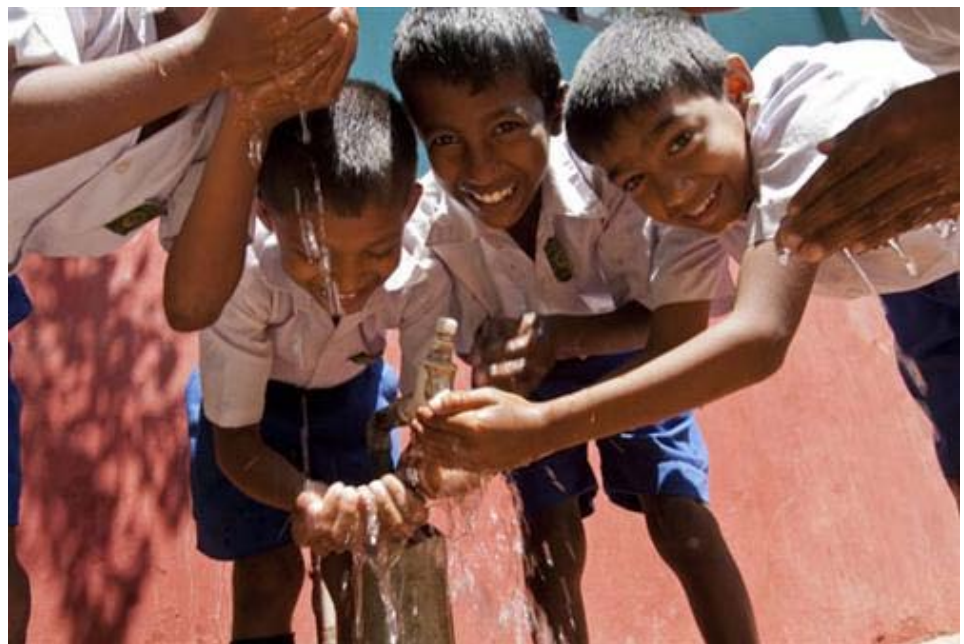
Boys drink water from a well outside a school in Ahangama, Sri Lanka

Rotarians have teamed up with nongovernmental organizations in Belgium to bring clean drinking water and improved sanitation to thousands of families in the poorest districts of Toamasina, Madagascar.