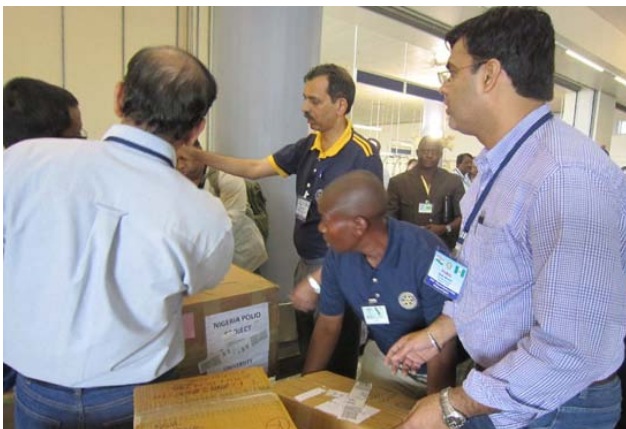
Nigerian Rotarians help surgeons from India unload baggage in Abuja

A group of Rotarians from India gave hope and dignity to about 400 children crippled by polio during a 10-day medical mission in Nigeria this month.