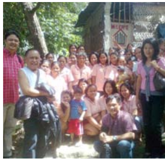
Philippine Rotarians conduct a survey of women who received loans from Ahon Sa Hirap, Inc., as part of a packaged grant.

Rotarians in Antipolo, Philippines, are teaching more than 2,000 women how to run businesses and balance family and work responsibilities, through an economic and community development project supported by a US$50,000 Rotary Foundation packaged grant.