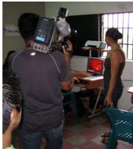
Students use the computer lab at one of the outreach centers near Tegucigalpa, Honduras, supported by Rotary clubs in the city and the Rotarian Action Group for Population Growth and Sustainable Development.