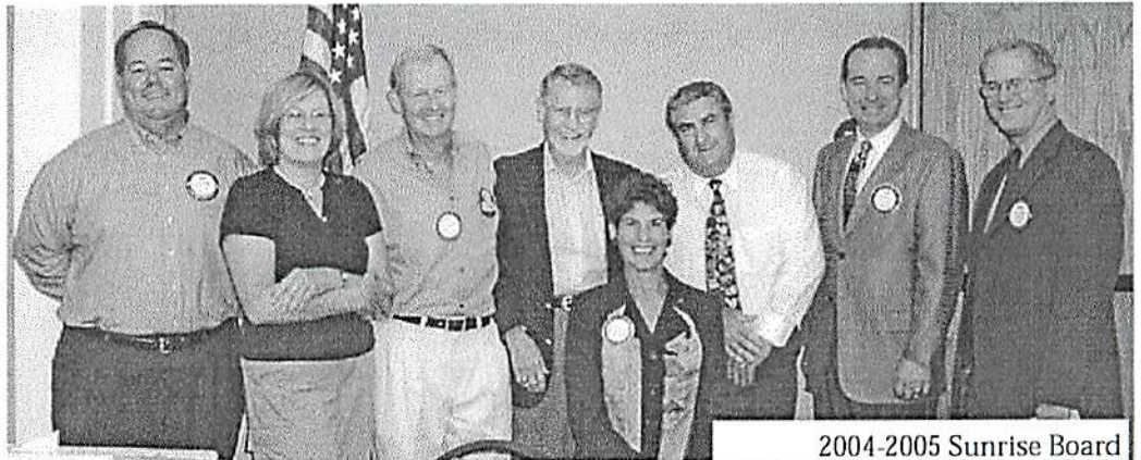
2004-2005 Sunrise Board