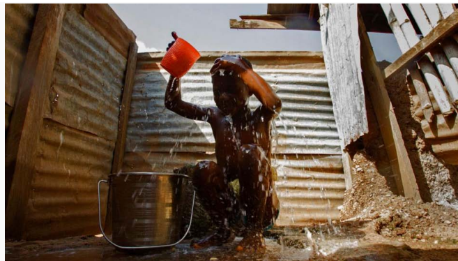
A young girl takes a bath using a single gallon of clean water.