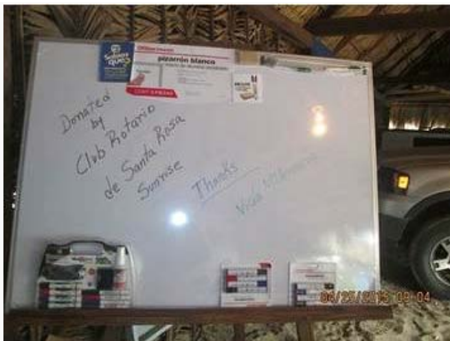
Donated by Club Rotario de Santa Rosa Sunrise THANK YOU!