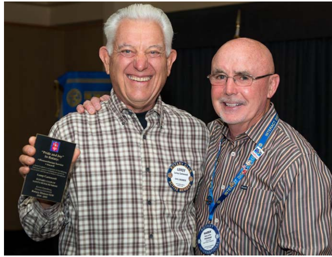
Rotary Club of Santa Rosa Sunrise - Founded June 30, 1986