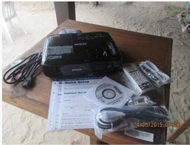
Projector and projector table/stand