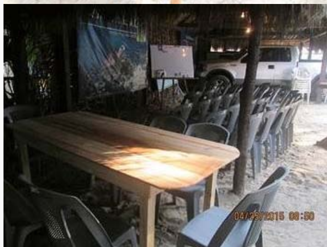
New tables, etc.