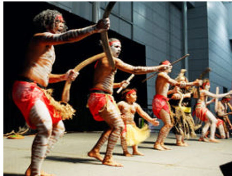
Nunukul Yuggera Wantamaa Indigenous Group welcome participants to Brisbane.