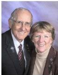
By Ernie Montagne District 5500 Governor