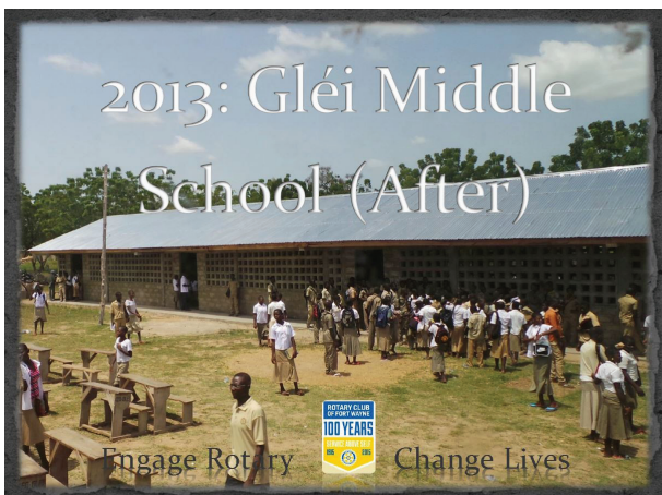
2013: Gléi Middle School (After) Middle school in Glei, Togo, West Africa built with Rotary grants