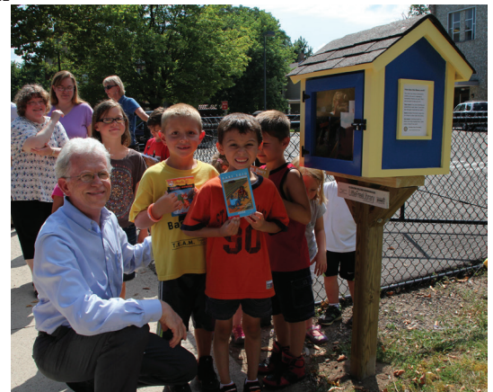
Little Free Library at Washington Elementary, one of over 100 Rotary installed in Allen County