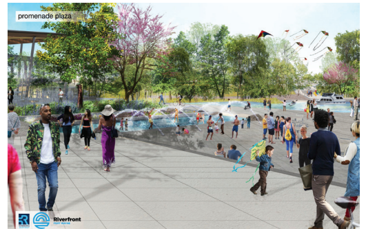
Water Feature in Promenade Park Downtown Fort Wayne