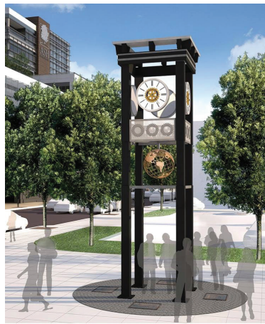
Rotary Clock Tower on the Allen County Public Library Green

Rotary International Youth Exchange Sponsor since the 1970's