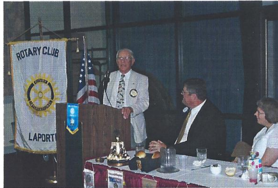
Rotary Club Meeting

Rotary International and the Rotary Club of LaPorte request all members maintain a 30% attendance rate. In Rotary we like to have all members involved in the club activities. We do not want members in name only.