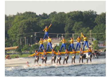
2018 Project: Hub of Awesome Water Ski Show