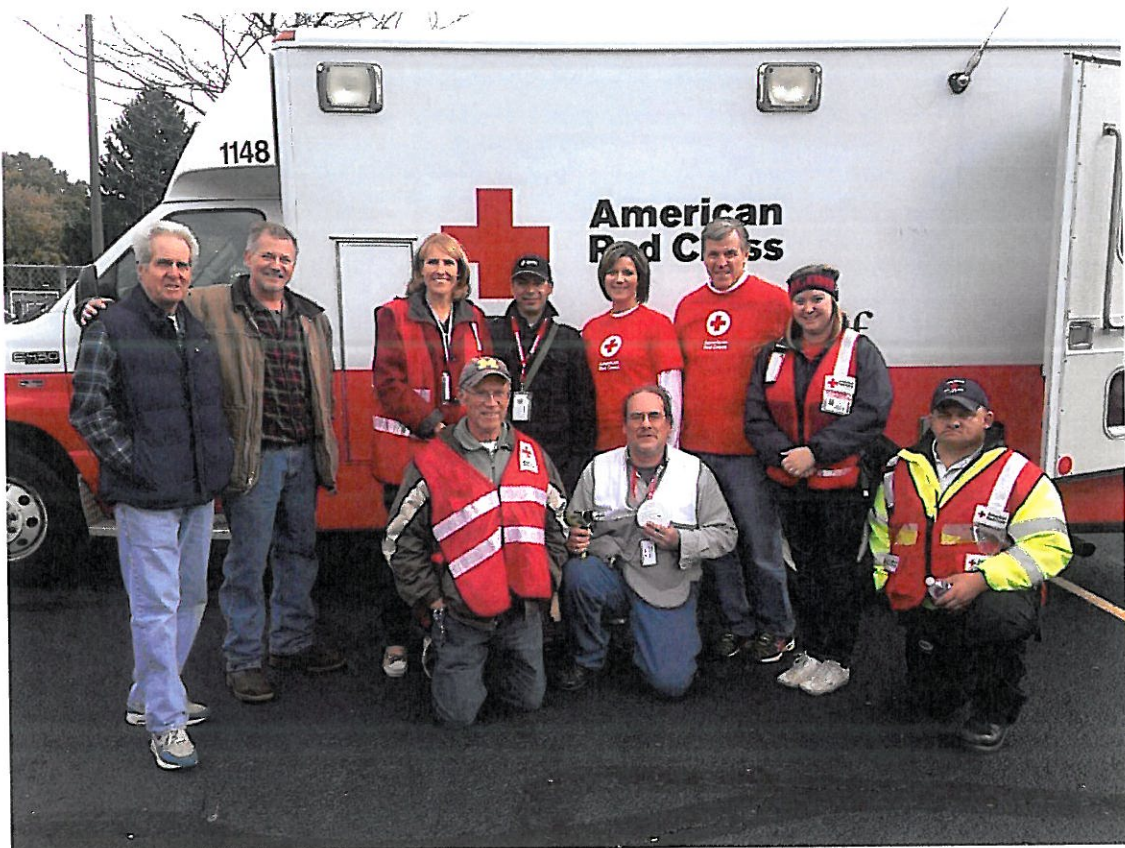
Volunteer group photo (not all pictured)