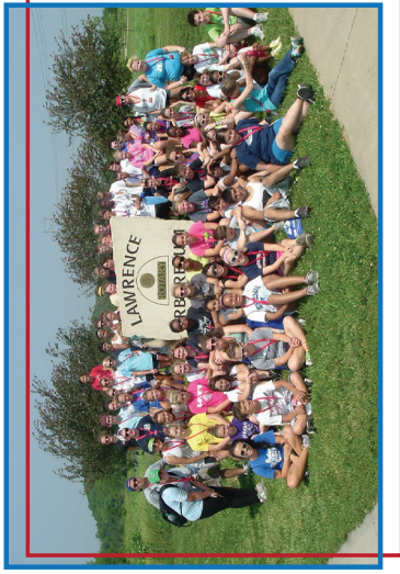
At RYLA you'll get to meet and bond with other people from across the state who share your passion for leadership!