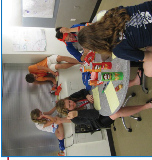
Develop your leadership skills in group case study exercises!