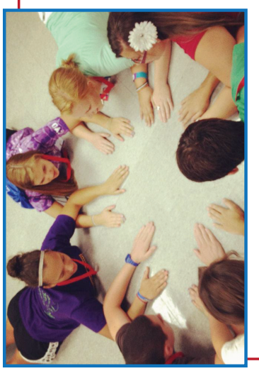
RYLA counselors are college students actively involved in their own leadership development who have completed RYLA counselor training. These counselors are supervised and guided by the professional staff of the KU Memorial Unions.