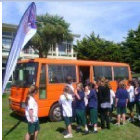
Launch - with - The - Edge - at - Tahuna - Intermediate

ChatBus is a free, mobile, counselling service, for children under 14 years, operating in Dunedin, New Zealand.