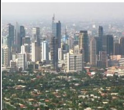
The City of Manila - Philippines

We have already had a month's worth of experiences.