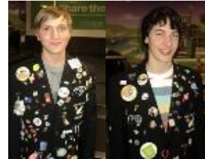
Group Study Exchange Students