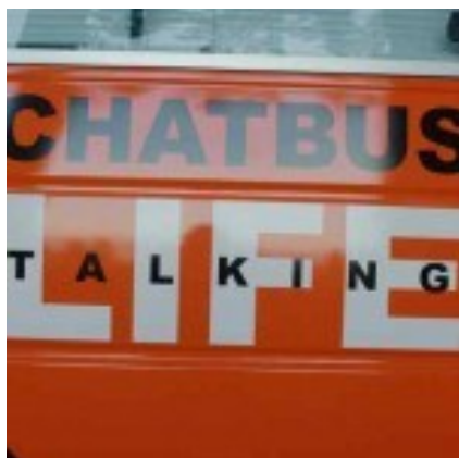
Talking- Through - Life