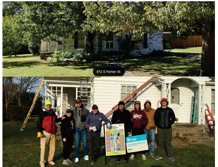
Above: the AFTER picture from the Painting Party.