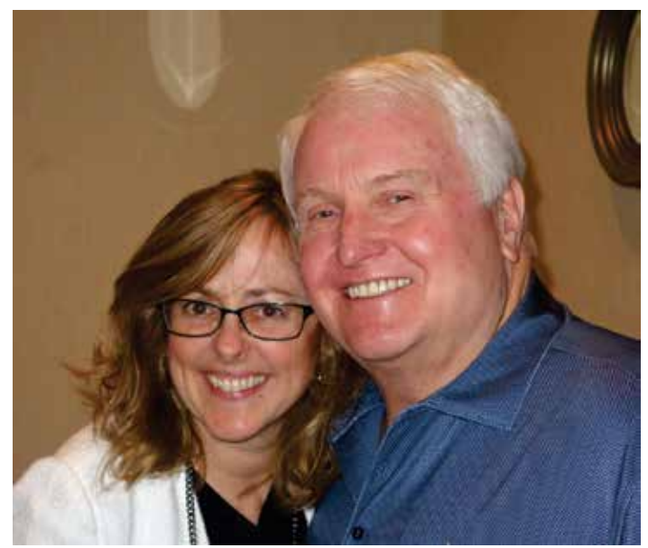
She next read the June birthday list (page 1, left column) and had us sing (!) HB2U to them all.