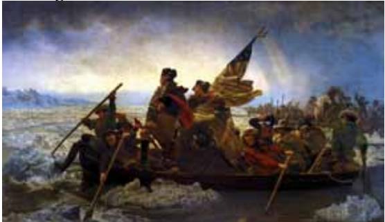
A LEADER PULLS; BOSSES PUSH.

"Authority without responsibility is a tyrant. Responsibility without authority is a victim." And the image that went with this was an unrecognized Daniel Morgan of Morgan's Rifles fame. His militia was instrumental in securing a victory at Saratoga.