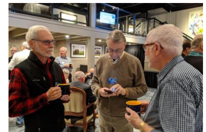
Members of Bookhawks, the Jayhawk Rotary book club, took time to discuss their next meeting.