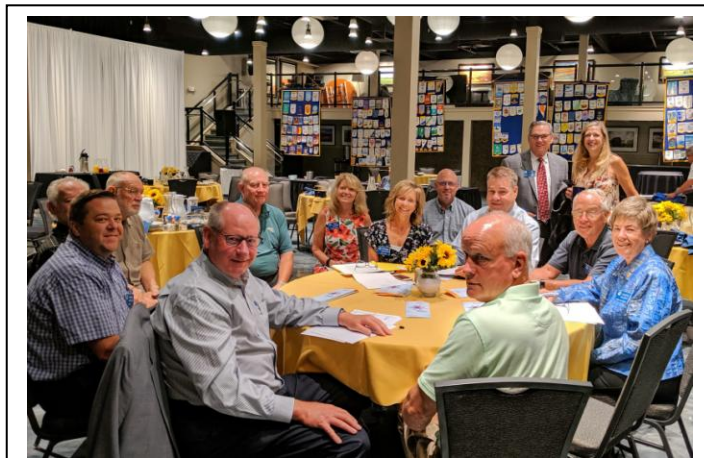
The Jayhawk Rotary Board met on August 8, 2019, following the club's regular meeting.