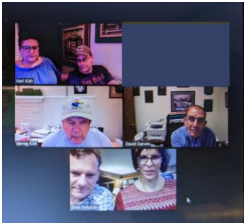
"Quizards of Oz"