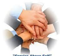
"Service Above Self"