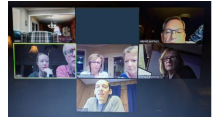
"COVID-FREE Brain Trust"