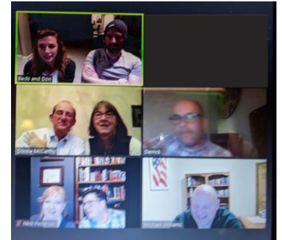
"This Is the Way"