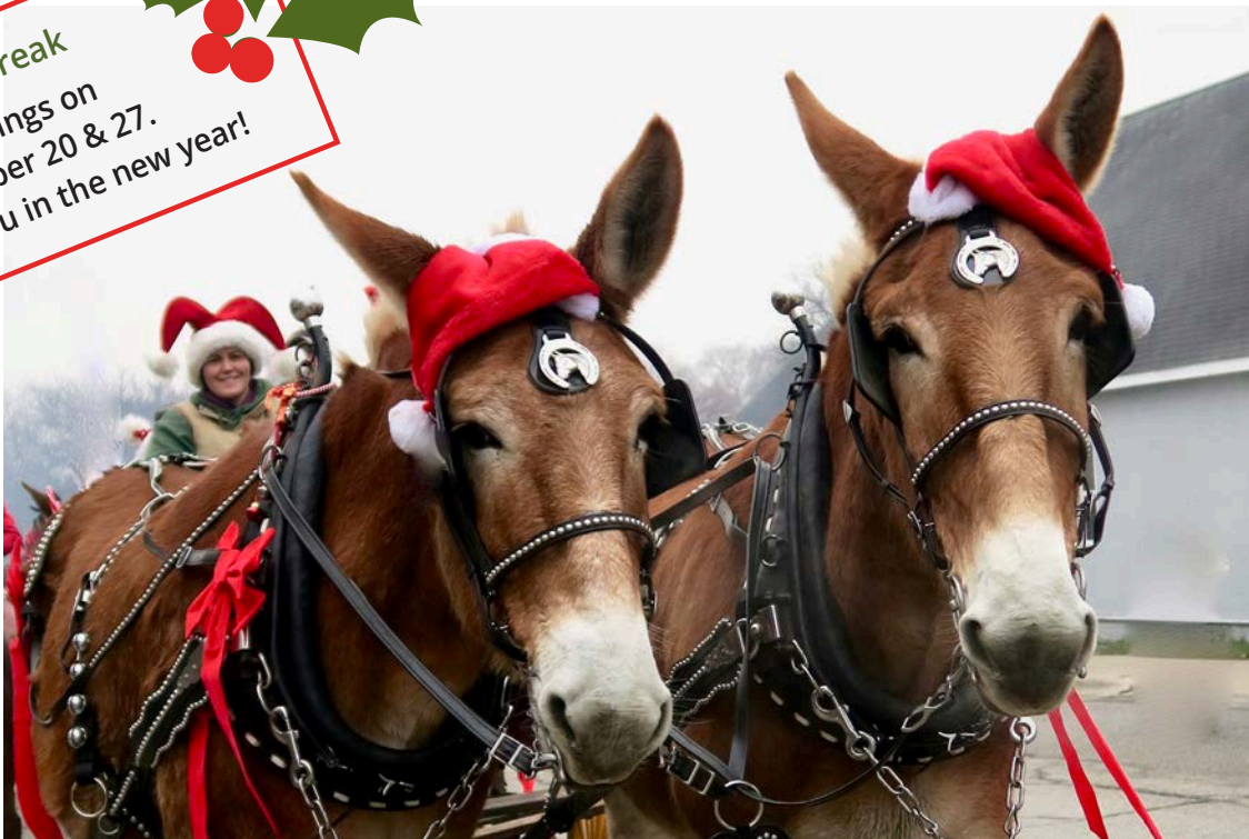
Festive mules strutted their stuff in Lawrence's Old Fashioned Christmas Parade.

Holiday Break No meetings on December 20 & 27. See you in the new year!