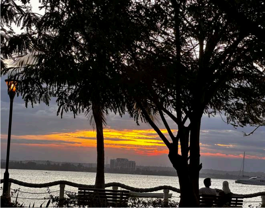
Sunset over the Indian Ocean in Dar es Salaam, Tanzania.