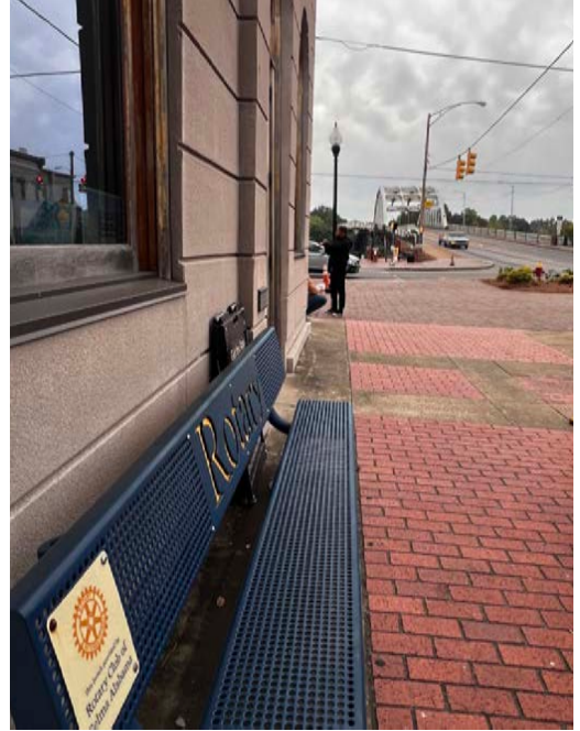
Rotary bench in Selma, AL, where thousands of people visit every year to walk across the Edmund Pettus Bridge, seen in the background. The Bridge was famously crossed by Dr. Martin Luther King, Jr., and thousands of others during the 1965 Voting Rights campaign.

Holiday Break No meetings on December 20 & 27. See you in the new year!